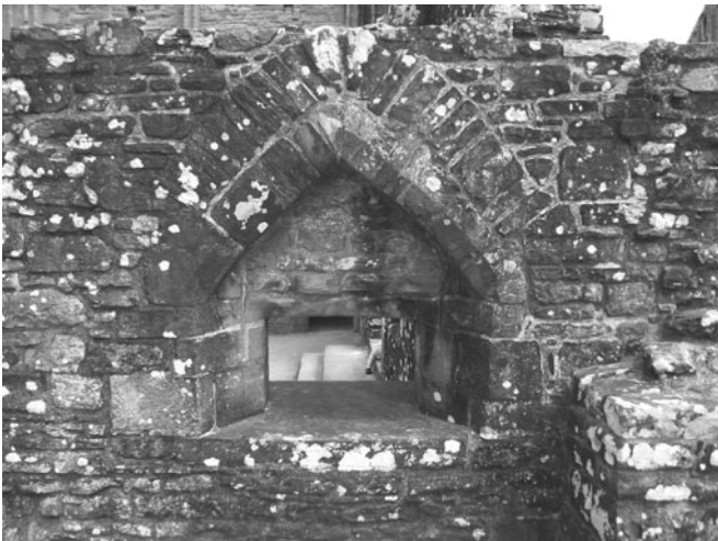
4. Serving hatch. Tintern Abbey kitchens, Monmouthshire

Once Romuald had established a community of like-minded hermits, greater variety and quantities of food were needed, but also the equipment and space to provide such food. The menu was still simple – fish-based soup and vegetables featured heavily – but it required a greater level of organization than had been needed by a single hermit. Similarly, Stephen's community at Obazine probably grew or harvested from the forest most of what they ate, but the process of turning it into food for the monks and nuns – for he also recruited women – required the establishment of a kitchen. Working in the kitchen was regarded as one of the acceptable forms of manual labour in the monastery. According to the Life of Stephen of Obazine , the food consisted largely of vegetable soups. While the monastery was in the process of being built, those who were less able to help by quarrying and carrying stone, or in the building work itself, were allowed to prepare the meals, serve and clear up afterwards. Stephen himself helped in this way.